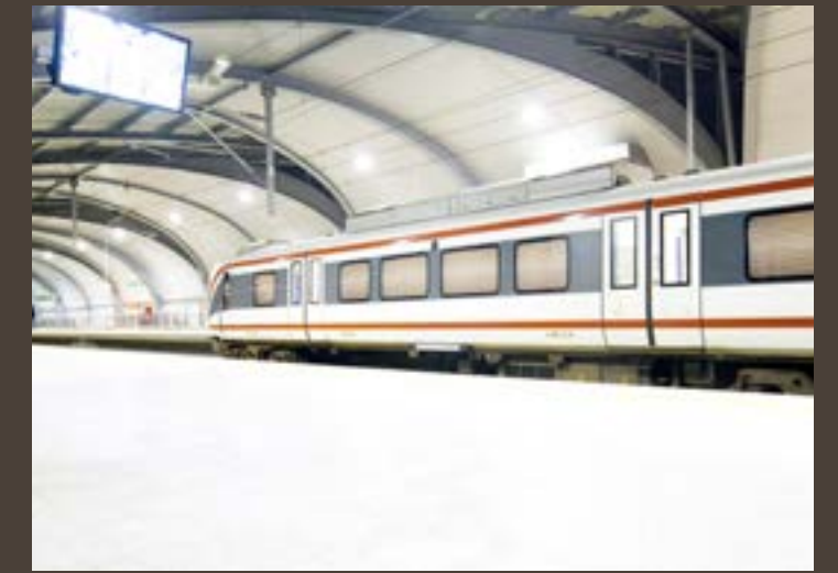
AIRPORT RAIL LINK